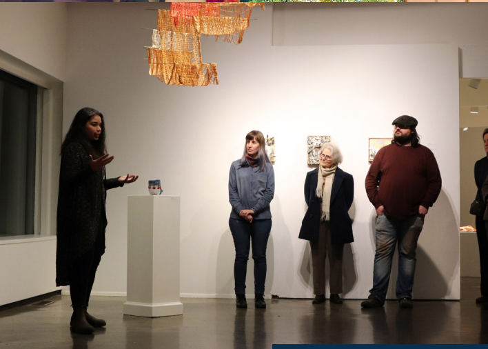
Port Angeles Fine Arts Center