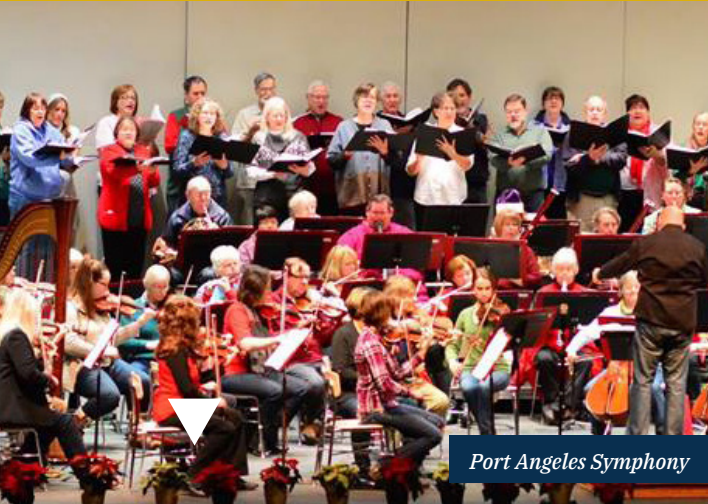
Port Angeles Symphony