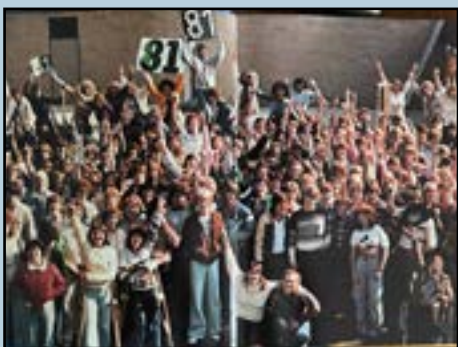
CLASS OF 1981

When making your gift to Field Hall, please specify your graduating class so that your gift can be applied towards a friendly class challenge. Awards will be given to classes who raise the most and who have the most individual donors involved.